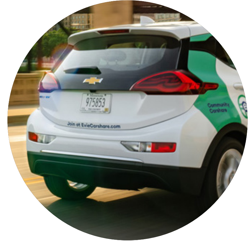
Car decal application.